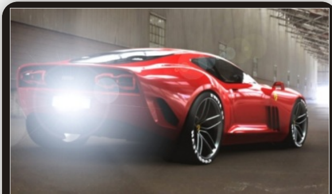
SCD-1 for most American Cars, Trucks and SUV's

THE BLINK OF AN EYE IS ALL THAT STANDS BETWEEN YOU AND A SPEEDING TICKET .... THAT'S ALL THE SCD ELIMINATOR NEEDS TO PROVIDE SECURITY, PRIVACY AND ID PROTECTION AT THE SPEED OF LIGHT INTRODUCING THE SCD ELIMINATOR FROM BJ BEARRS SPARES