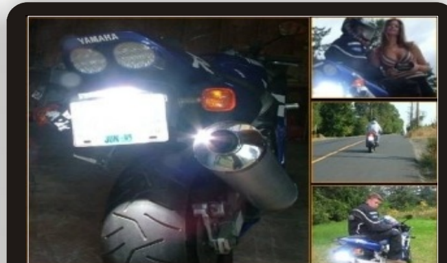
SCD-M for all Motorcycles and Scooters