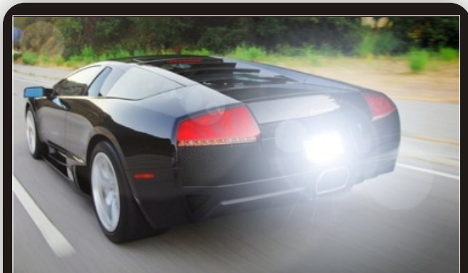
SCD-3 for most Euro/Asian/Oceania Cars, and SUV's